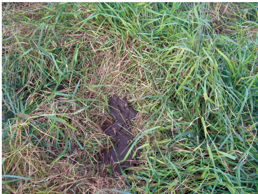
Third stage larvae (L3) may be found up to 12 inches away from a fecal pat and as high as 4 inches up on grass stems.

Incorporating mob grazing events that leave substantial residual plant biomass and extend rest intervals (60 days or more) may also help manage the number of L3 consumed. Inclusion of alternative types of pasture forage sources, such as cover crops, small grains, and hay aftermath as part of the farm grazing system strategy can also assist by decreasing exposure to helminths from permanent pasture areas.