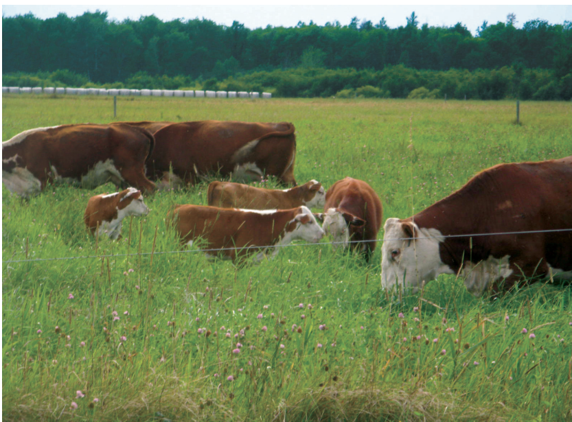
These calves need not be dewormed until after weaning.