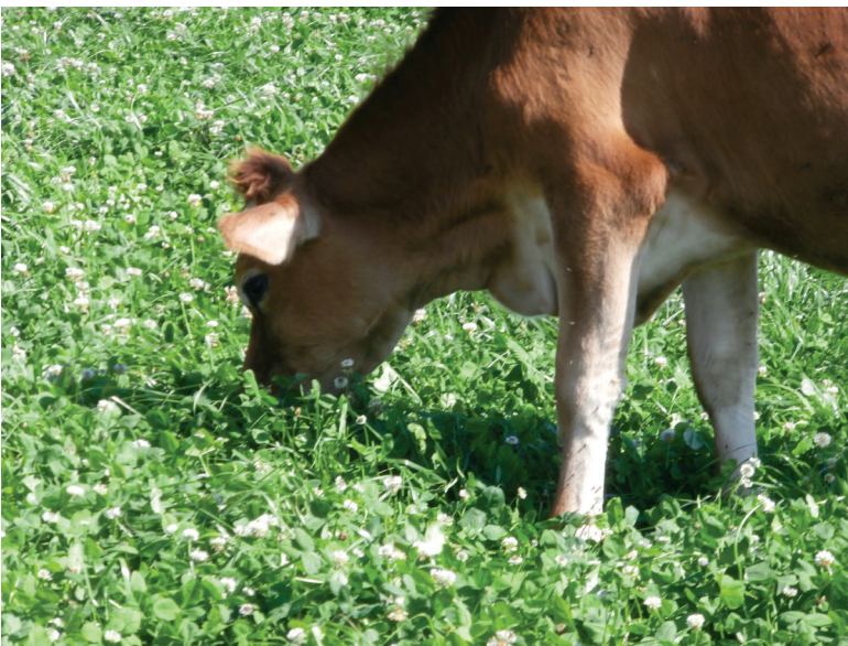
To reach production goals, integrate pasture management and use of dewormers.

Exposure to nonlethal doses (sub-therapeutic use) allows for genetic mutation to that ingredient class. In addition to the problems already discussed with pour-on products, sub-therapeutic use also happens when the incorrect dose is delivered either by poorly calibrated equipment or by not dosing to the actual weight of the animal. In addition, either host or helminth physiology or drug pharmacokinetics may result in nonlethal exposure.