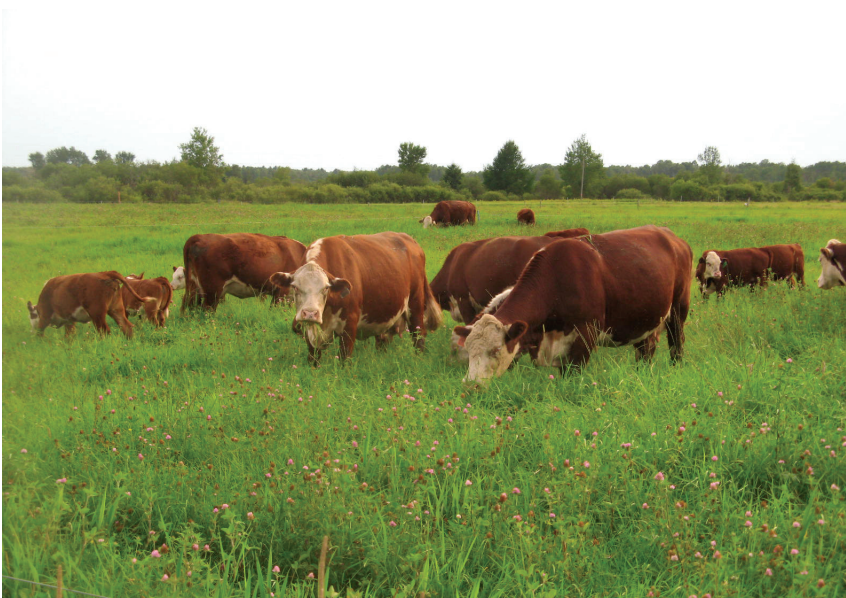
Maintaining residual plant height and appropriate stocking density helps control worm infestation. Adults that are not dewormed serve as a source of refugia to younger stock.

Larvae not exposed to dewormers at the time cattle are dewormed are known as refugia. Refugia include larvae residing on pasture or within the intestine at the time of deworming. Intestinal larvae may not be exposed to the treatment due to various chemical or biological factors. Untreated herd mates also contribute to refugia. Stage L3 larvae on pasture at the time of treatment contribute to refugia when they are not ingested prior to clearance of the dewormer from the treated animal.