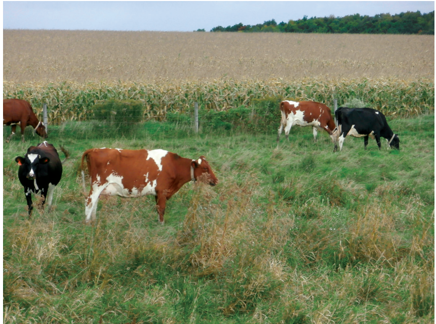
Parasitic worms may hinder the performance of pastured cattle.