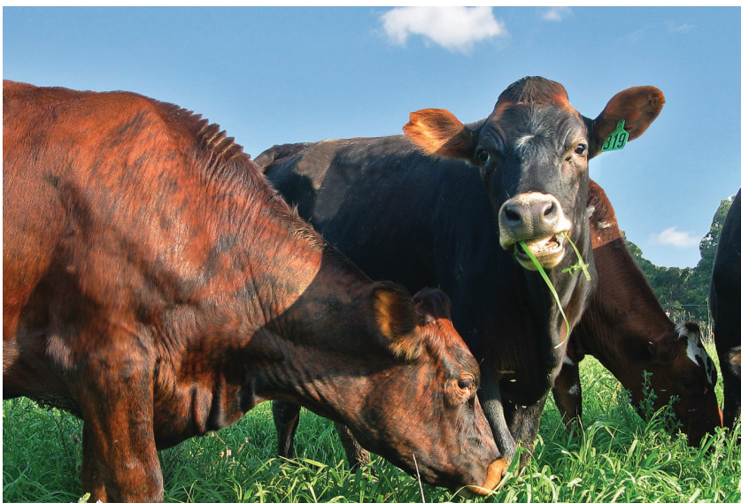
Do not allow cattle to graze below the target plant residue height.

Rotational grazing systems provide several positive economic and production benefits to the cattle production system, but they concurrently provide an environment that may enhance larval infestation. To decrease the potential for increased parasite exposure when using a rotational grazing system, use short grazing occupancy times (less than four days) so that animals do not graze below target plant residue heights. Use multiple paddocks to ensure longer rest intervals (30–45 days or more) for each pasture unit to allow adequate pasture regrowth.