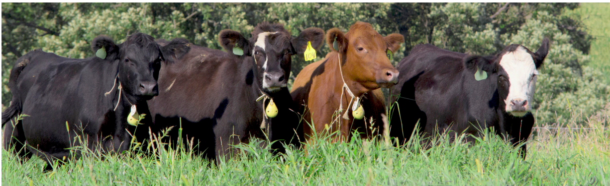
Allow dewormed cattle to remain in the same area for at least a week after treatment so they can continue to graze refugia larvae.

Concurrent administration of benzimidazoles enhanced the efficacy of injectable and pour-on MLs as evidenced in the 2008 and 2013 FECRT database update discussed earlier. 3,25 Combination therapy achieved greater than 99% fecal egg count reduction in both years. Resistance to all MLs is delayed when used in combination with benzimidazoles or imidazothiazoles. 6,7,25 Double and triple combinations have been used for many years in some countries,