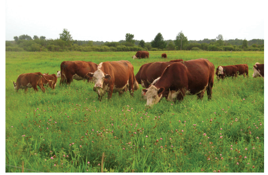
Maintaining residual plant height and appropriate stocking density helps control worm infestation. Adults that are not dewormed serve as a source of refugia to younger stock.

A mixed population of worms often resides in the host. Removal of drug sensitive Ostertagia after using a broad-spectrum product may leave behind a resistant population of Cooperia.<sup>6, 10</sup> In this instance, a FECRT result would fail efficacy, but the producer would not know the dominant worm population until a PCR or other advanced test is used. Better treatment decisions can be made when the worm's identity is known.