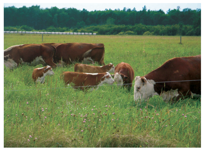
These calves need not be dewormed until after weaning.

Beef calves nursing grazing cows obtain the majority of their nutrition from their mother's milk, not from pasture. Nursing calves on pasture are gradually exposed to helminths as they age and consume more forage. This gradual exposure is needed to develop the calf's tolerance to helminths. Maximal growth of preweaned calves is not absolutely necessary, and unweaned calves can