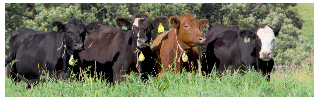
Allow dewormed cattle to remain in the same area for at least a week after treatment so they can continue to graze refugia larvae.

Concurrent administration of benzimidazoles enhanced the efficacy of injectable and pour-on MLs as evidenced in the 2008 and 2013 FECRT database update discussed earlier.<sup>3, 25</sup> Combination therapy achieved greater than 99% fecal egg count reduction in both years. Resistance to all MLs is delayed when used in combination with benzimidazoles or imidazothiazoles.<sup>6,7, 25</sup> Double and triple combinations have been used for many years in some countries,