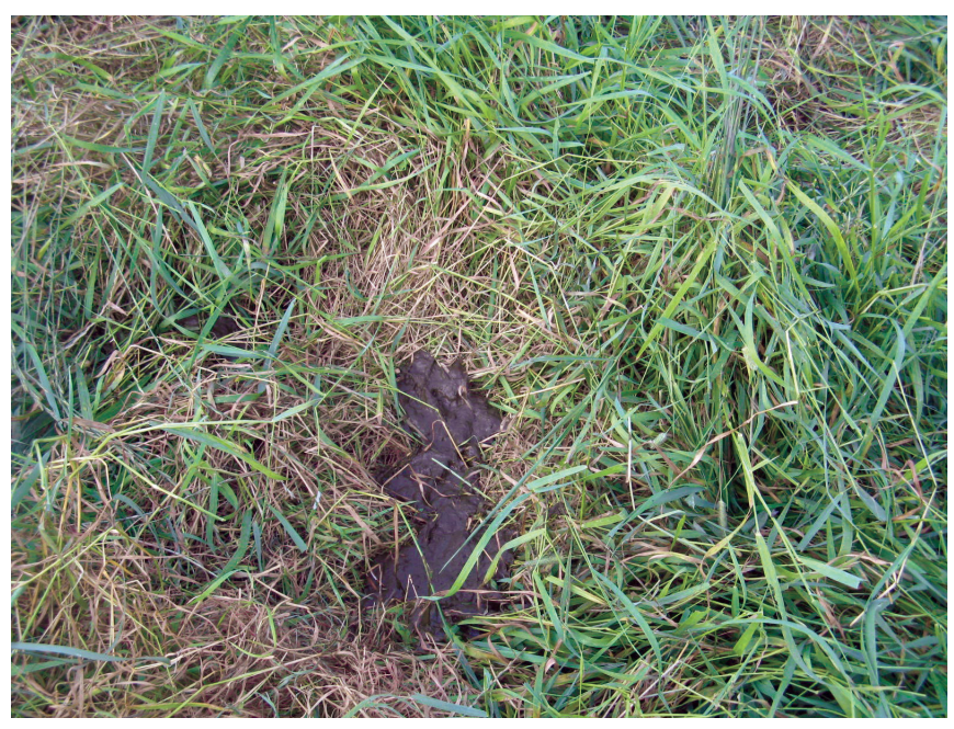
Third stage larvae (L3) may be found up to 12 inches away from a fecal pat and as high as 4 inches up on grass stems.

Incorporating mob grazing events that leave substantial residual plant biomass and extend rest intervals (60 days or more) may also help manage the number of L3 consumed. Inclusion of alternative types of pasture forage sources, such as cover crops, small grains, and hay aftermath as part of the farm grazing system strategy can also assist by decreasing exposure to helminths from permanent pasture areas.