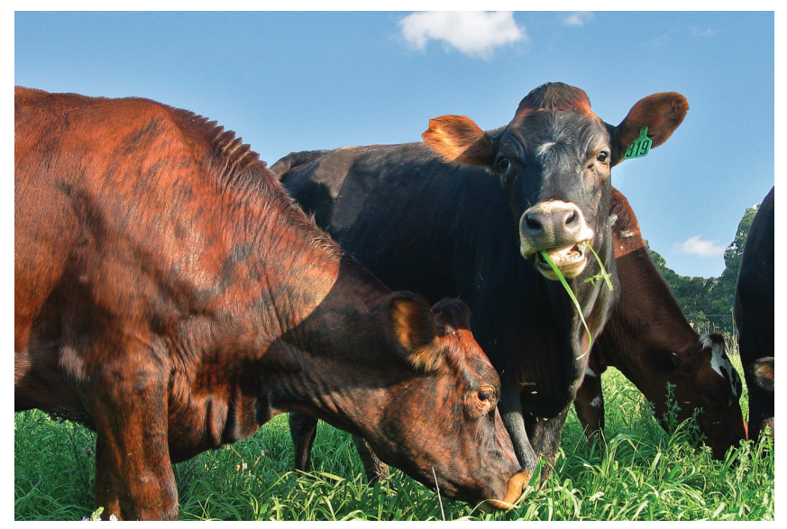
Do not allow cattle to graze below the target plant residue height.

Grazing permanent pastures (setstocked grazing systems) at a light stocking rate can provide adequate helminth management since animals selectively graze around well-formed manure pats and this decreases the incidence of L3 ingestion. However, set stocking results in poor forage utilization patterns. Often 50%–60% of pasture forage production is wasted, and cattle choose to overgraze selected areas. Overgrazing has the potential to increase weed pressures and erosion issues due to reduced pasture plant vigor.