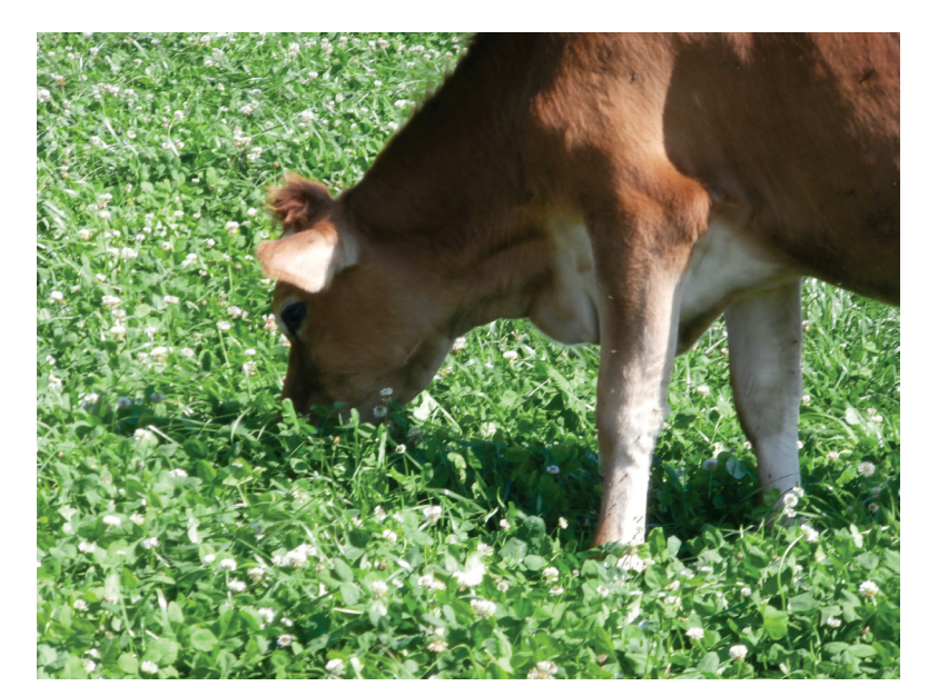
To reach production goals, integrate pasture management and use of dewormers.

Skin is naturally designed to prevent transfer of chemical agents. Pour-on MLs rely on uptake through the hair follicle, which is impeded by excessive hair, dirt, or mud. Sub-therapeutic use happens when pour-on products are applied to long-haired animals, for example during winter or before cattle shed their heavy coats in spring. Some formulations readily wash off when exposed to water, which can occur through rainfall or when cattle enter ponds or streams.