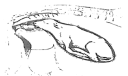
One foreleg retained. Head and presenting limb must be pushed back while the retained leg is flexed and brought into position.

Have your veterinarian conduct 30-day post-calving uterine examinations on those cows that experienced difficult calvings (and/or those whose calves you pulled) or retained placenta.